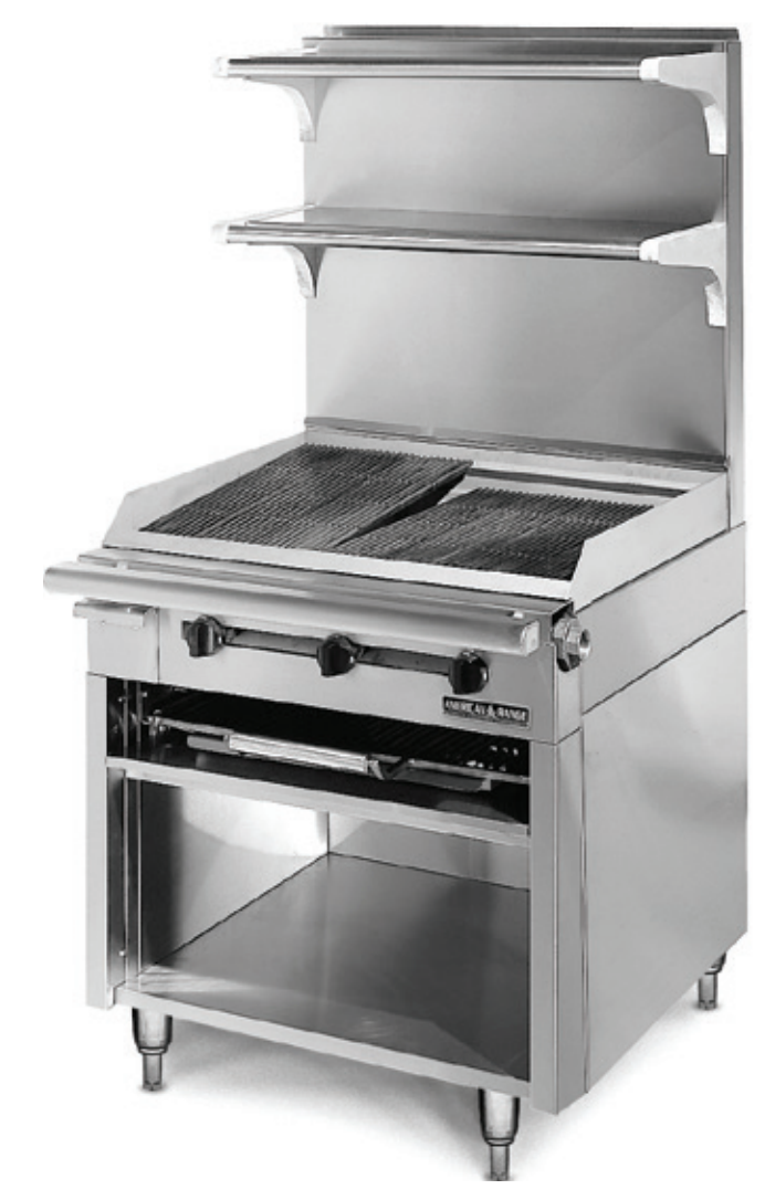
Model HD34-CRB-0 Shown with optional high riser & shelf